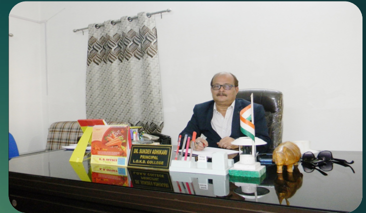
Principal LOKD College, Dhekiajuli

Named after the polymath freedom fighter Lokanayak Omeo Kumar Das and sprouting out of the long cherished Dreams of the denizens of a large vicinity in between Kharupetia and Tezpur for quality Higher Education, LOKD College (HEI) has been living up to the expectations of all concerned till date. Adhering to the motto of Higher Education "Higher Education with Direction", our college has left no stone unturned in its Endeavour to lay the right foundation for Higher Education for our posterity. Our commitment towards our society in relevant spheres has also provided yet another feather to our institutional identity as a harbinger of a New Era in every aspect. Let us join hands and contribute to the all round growth of this loved institution of yours in the future years.