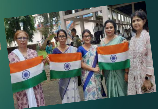
Our Pride Participants in Republic Day Camp 2024 & The Prime Minister Rally 2024 at New Delhi